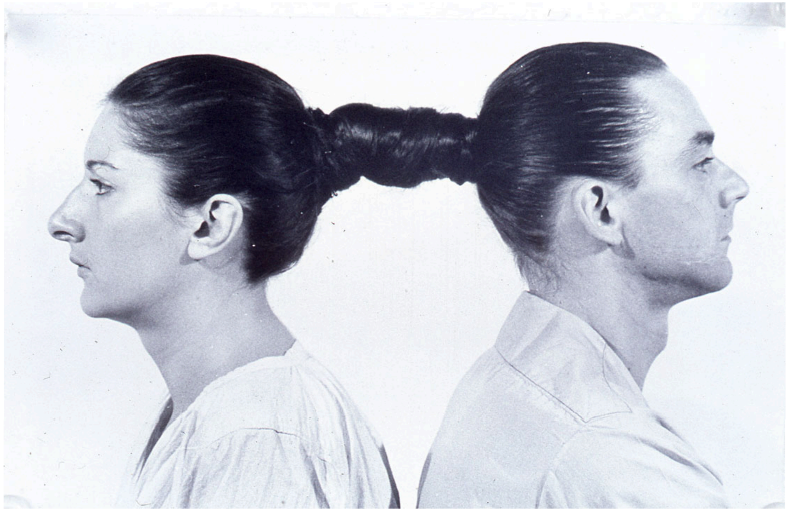
Marina Abramović & Ulay "Relation in Time" 1977 Performance: 17 hours