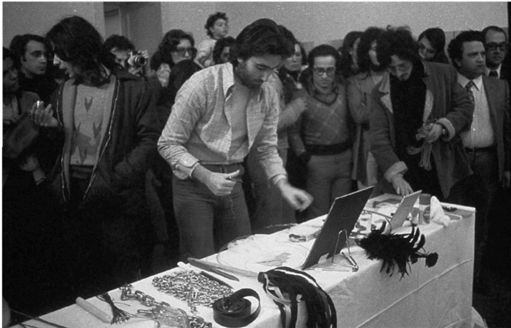
Marina Abramović "Rhythm 0" 1974 Performance: 6 hours