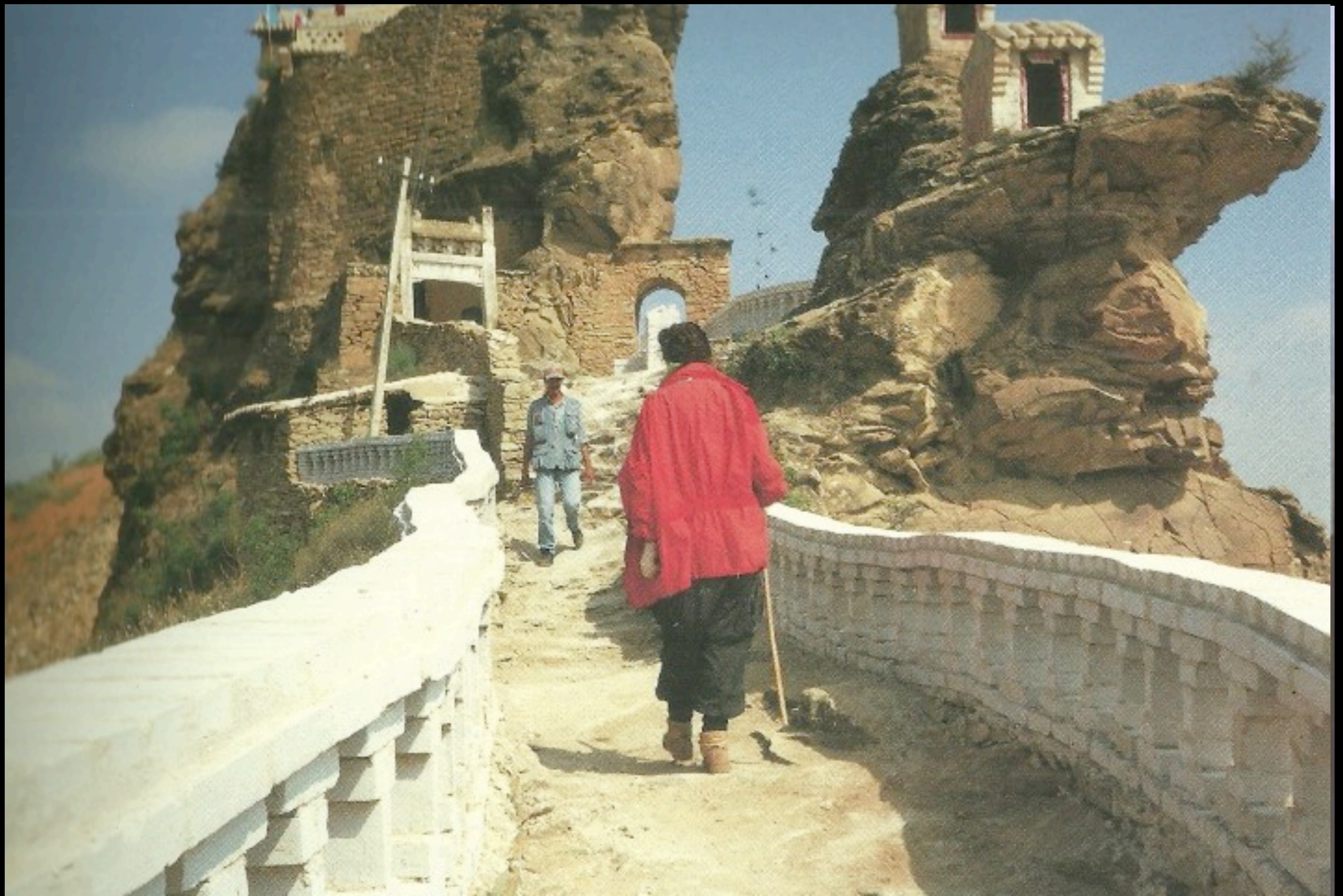
Marina Abramović & Ulay "The Lovers: The Great Wall Walk" 1988 Performance: 90 days