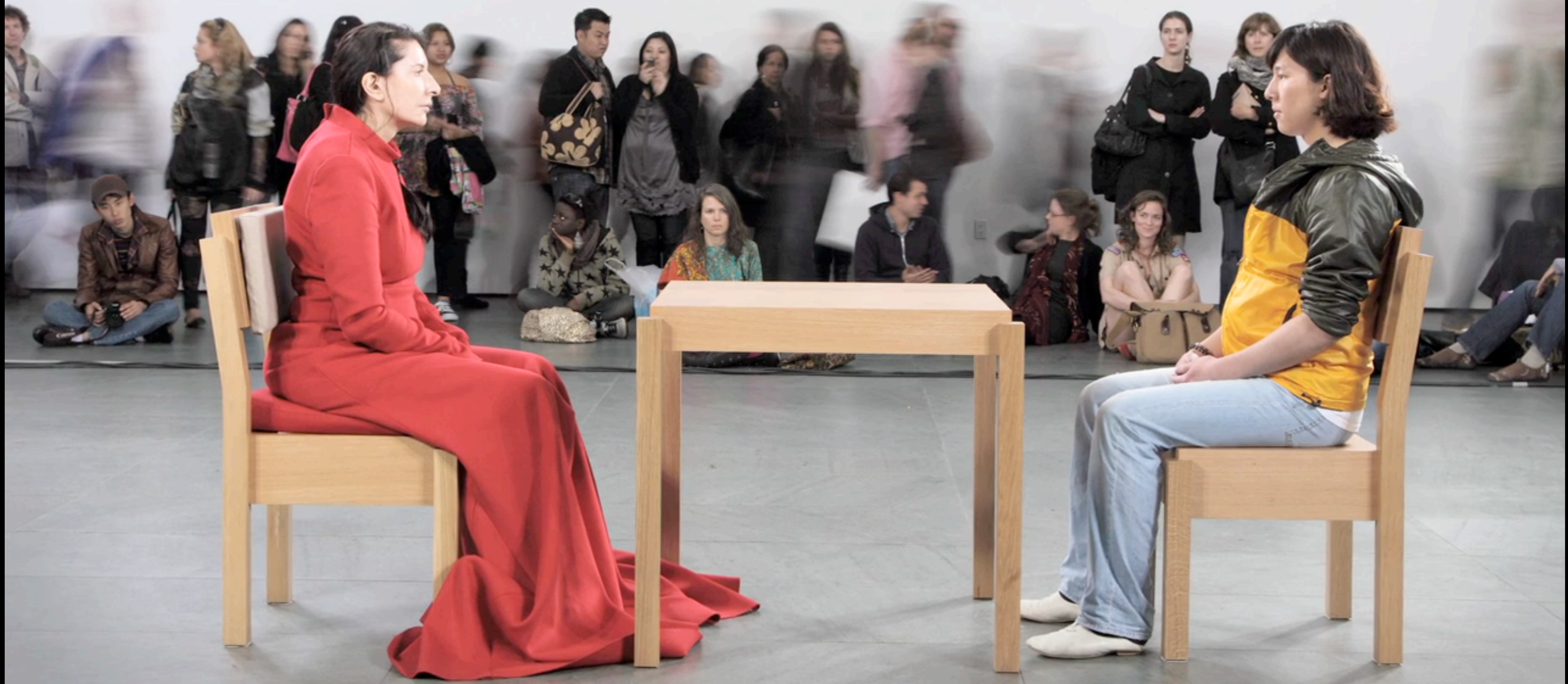
Marina Abramović "The Artist is Present" 2010