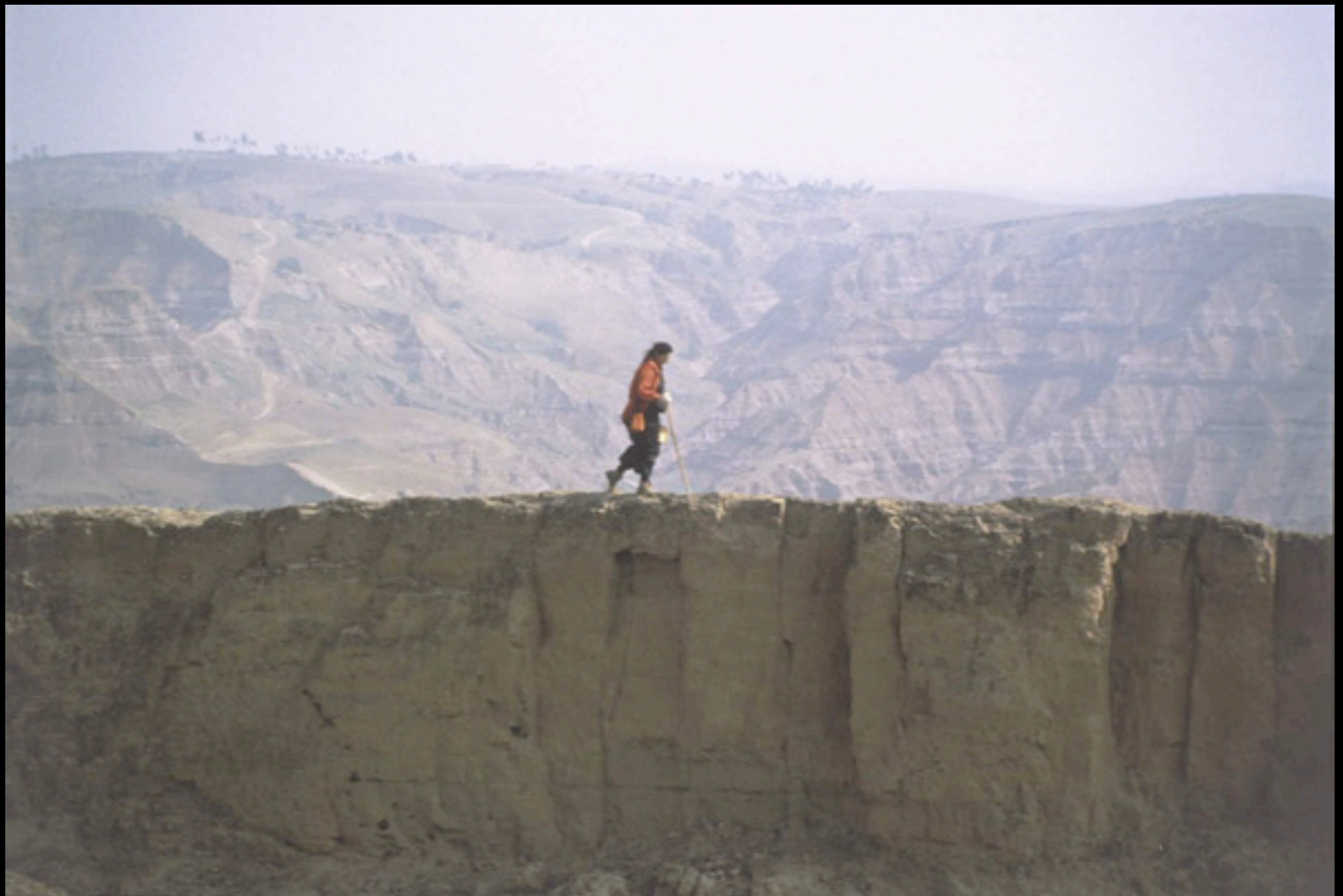
Marina Abramović & Ulay "The Lovers: The Great Wall Walk" 1988 Performance: 90 days