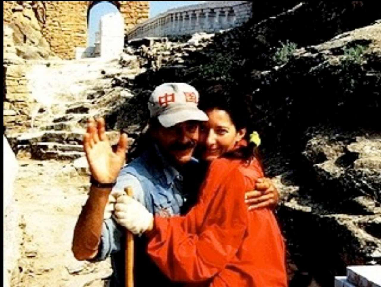
Marina Abramović & Ulay "The Lovers: The Great Wall Walk" 1988 Performance: 90 days