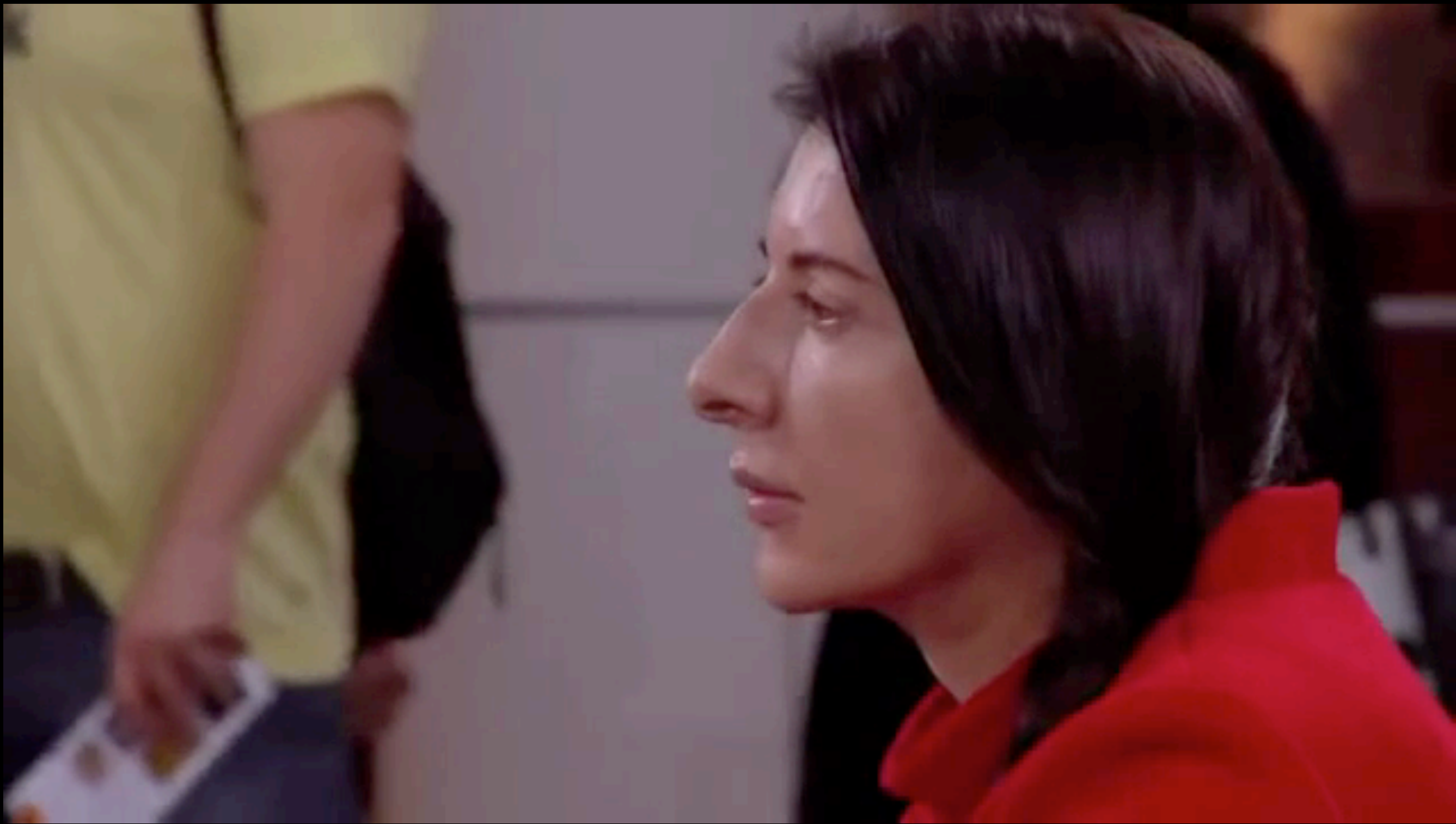
Marina Abramović "The Artist is Present" 2010